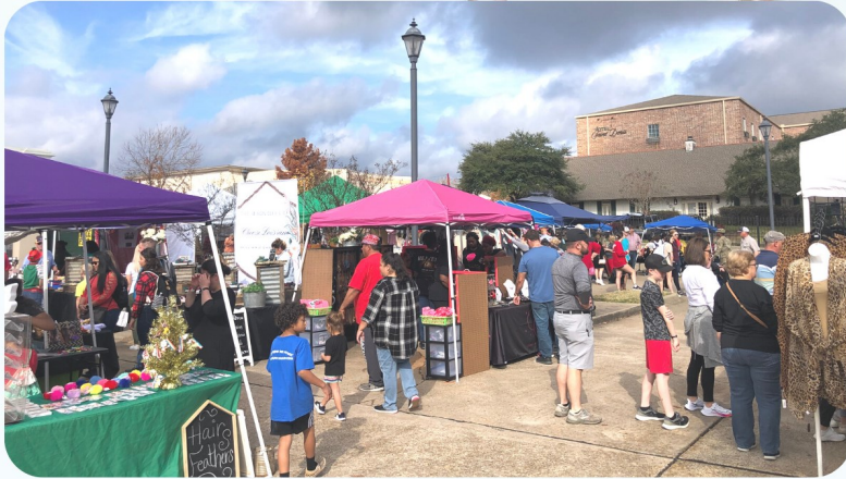
Mistletoe Market was a success!

For those who do not know, City Bank & Trust Company graciously allows us to use their parking lot on Christmas Festival Day - and we turn it into the only craft and vendor market on the parade route as a fundraiser for us.