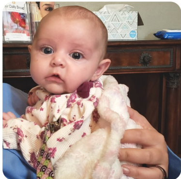
*born in October

"The education that was given to me has allowed me to better prepare as a mother to my new baby. I did not have the resources years ago to be a better parent and care for my child and myself. I enjoyed the talks that went beyond the program too. I love that I am able to talk freely and have prayer at any time needed."