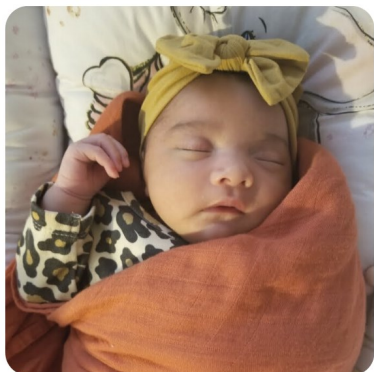
*born in November

"All I know is that I don't know what I would have done without the WRC."