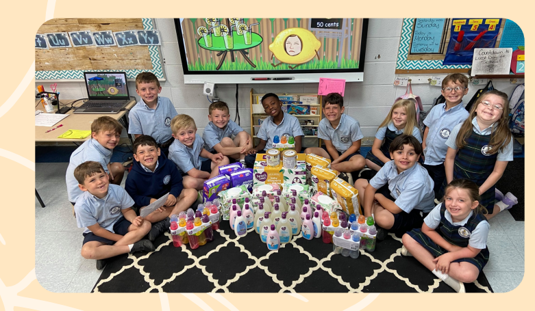
Mrs. York's class at St. Mary's raised funds during Field Day at their lemonade stand and knew they wanted to support the moms of Natchitoches!