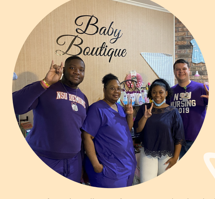
A group of NSU's College of Nursing and School of Allied Health collected diapers, wipes, and baby toiletries as a part of their Service Learning project.