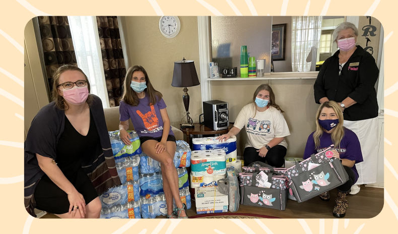
The NSU BCM CWOM (Campus Women on Missions) group got together and collected a wide variety of items for us!