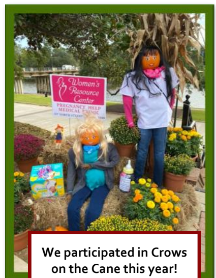
We participated in Crows on the Cane this year!