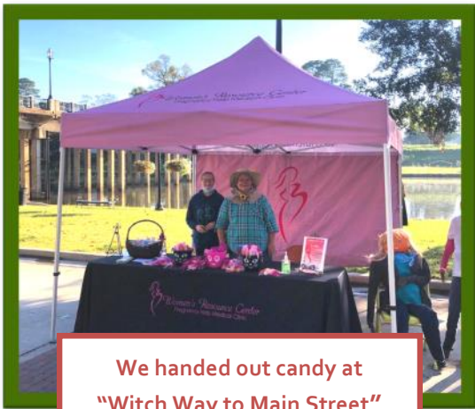
We handed out candy at "Witch Way to Main Street"