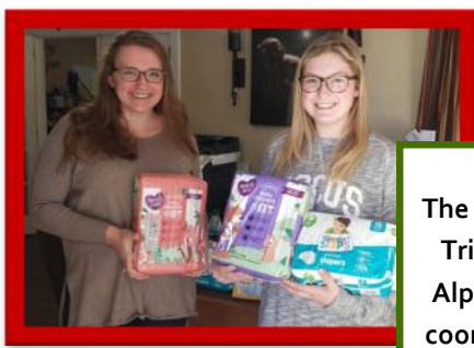
The ladies of Tri Sigma Alpha Zeta coordinated a diaper collection for the WRC!