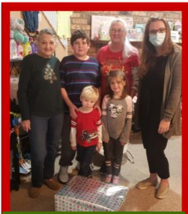
The young people of Davis Springs Baptist Church collected items for the WRC